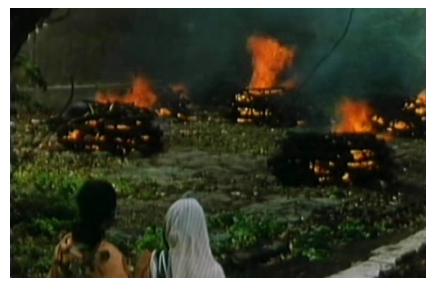
Fig 7 Improper funeral of rebels