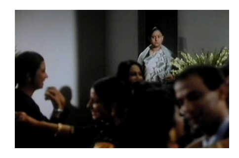
Fig 8 Psychic distance from middle class